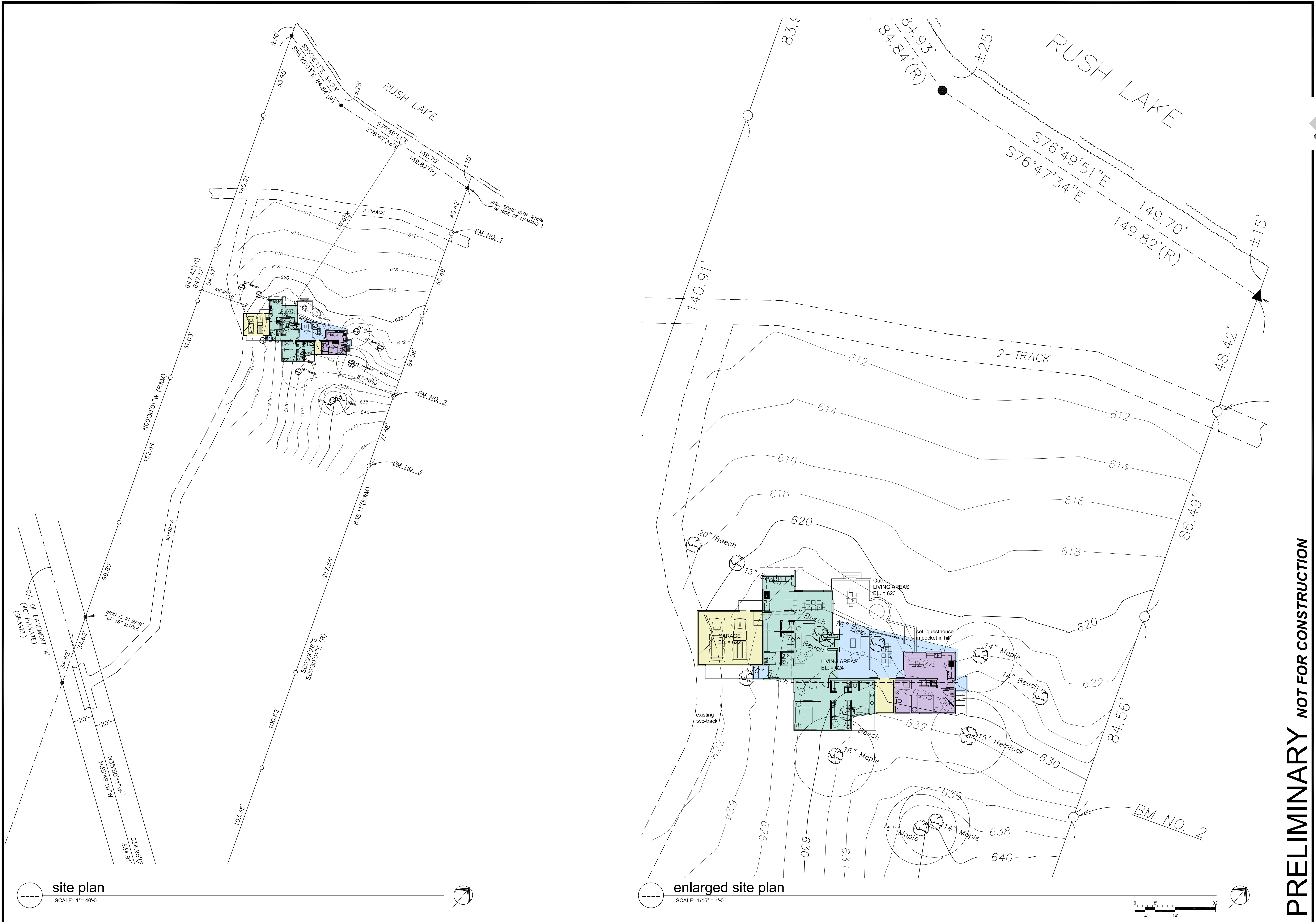
site plan SCALE: 1" = 40'-0"